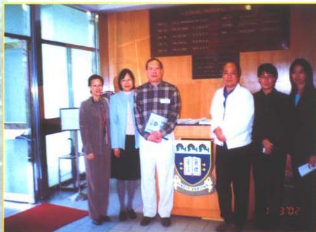
Taken with the Vice Principals at the School's Reception.