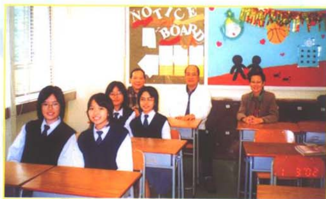
Recalling sweet memories in his previous seat in the F.5 Class, with some present F.3 students.

USAF specialized air-superiority unit in Southeast Asia, 3 rd Tactical Fighter Squadron flying the F-4E "Phantom" After his tour of duty in Southeast Asia, he was assigned as the Air-to-Air Combat Instructor to the 91 st and 92 nd Tactical Fighter Squadrons flying F-4D, A-10 "Warthog" at RAF Bentwaters/Woodbridge (near Ipswich) Suffolk, UK. Later he became a Senior Bomb Commander at the 81 st Tactical Fighter Wing in England for NATO associated with flying F-111 at RAF Lakenheath (near Cambridge) in England. He has had so many interesting stories to tell. His last military assignment was at the Headquarters Pacific Air Forces, Honolulu, Hawaii overseeing F-16 Foreign Military Sales to Singapore and Thailand and Military Assistance to Indonesia and Malaysia. He left active military duty with the rank of Major and joined the